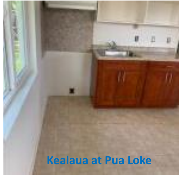
Kealaua at Pua Loke